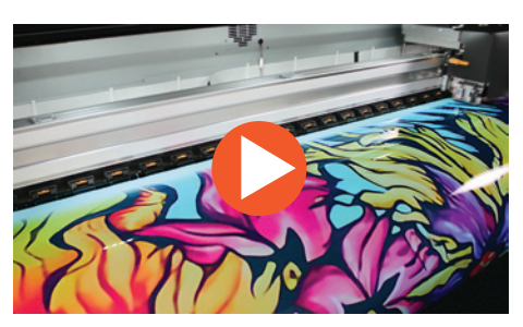
VISIT MUTOH EUROPE ON YOUTUBE